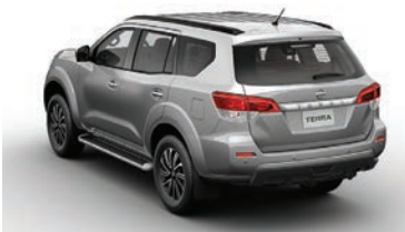
K23 BRILLIANT SILVER