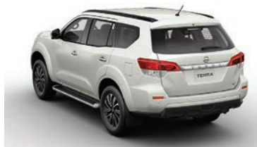
QX1 WHITE PEARL