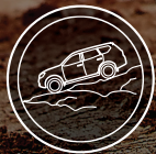
Hill Descent Control