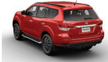
AX6 BURNING RED