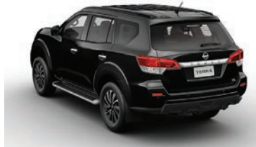
G42 BLACK STAR