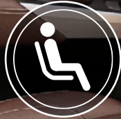
Zero Gravity Front Seats