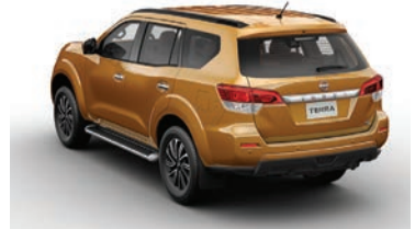
HAJ GOLD BEIGE