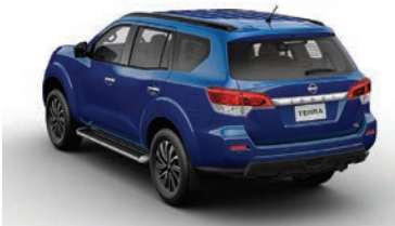
RAA DARK BLUE