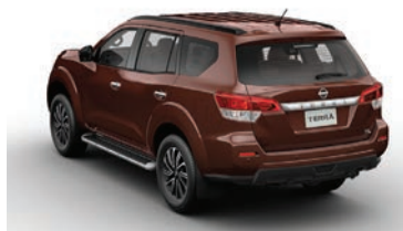
CAQ EARTH BROWN